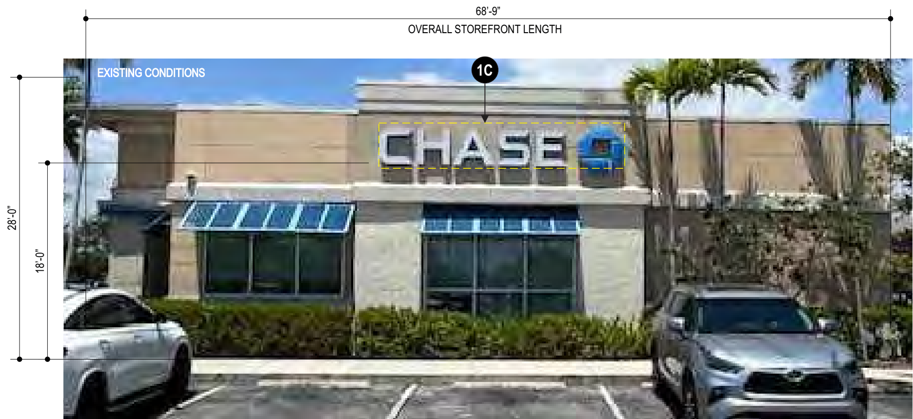
1D EAST EXTERIOR ELEVATION SCALE: 1/8" = 1'-0"